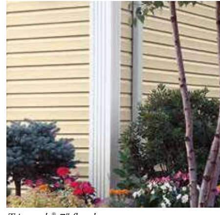
Trimworks® 7" fluted corner post.