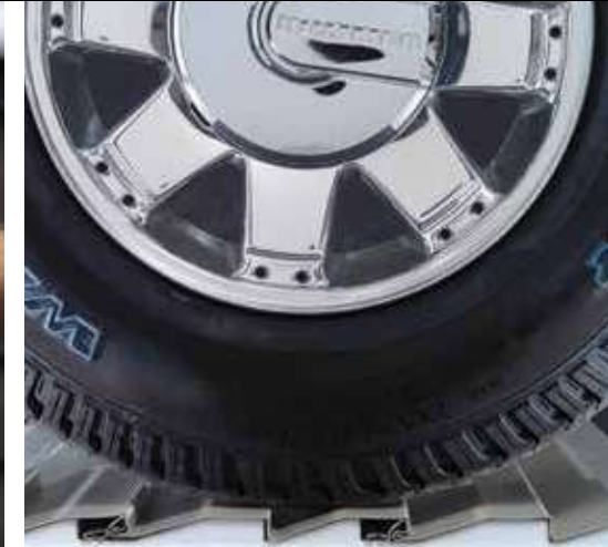
Contoured insulation give Charter Oak Energy Elite additional support and increased durability.