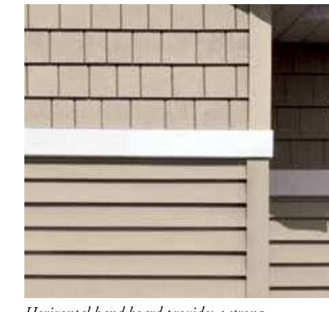
Horizontal band board provides a strong horizontal accent.