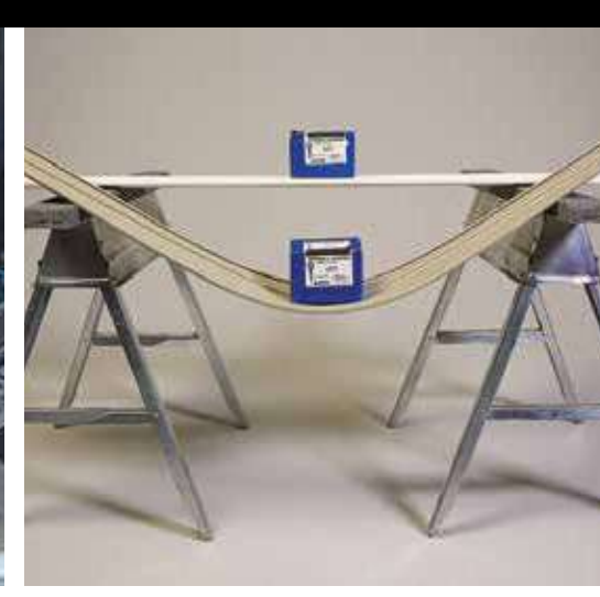
In strictly controlled laboratory comparisons, Charter Oak remained rigid, while the competition sagged.

CHARTER OAK ENERGY ELITE IS AN INVESTMENT that really pays dividends. Energy savings and freedom from maintenance are so desirable that chances are your new siding can more than pay for itself in increased home value. And it will always be