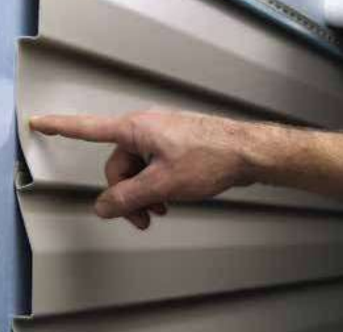
Traditional siding yields a hollow void between the siding and the wall.