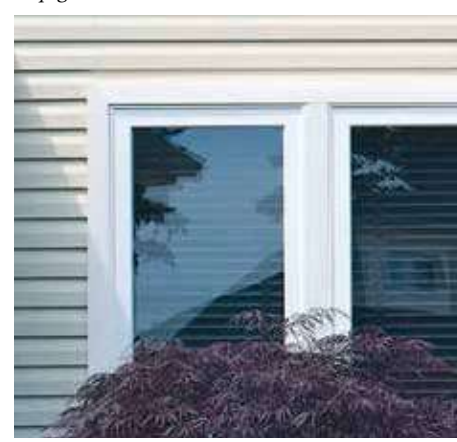
Charter Oak dutch lap with Trimworks 3-1/2'