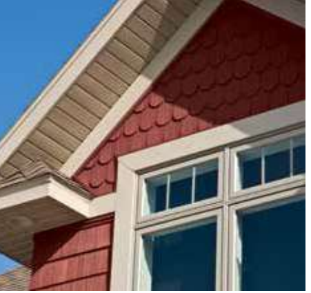
Alside Premium Scallops – Victorian inspired half-round shingles.