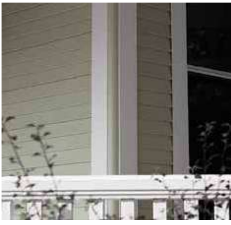
Trimworks three-piece beaded corner post.

Alside offers a wide selection of trim and accent products made to complement the beauty and colors of Charter Oak Energy Elite siding.