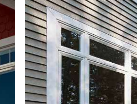
Charter Oak clapboard with Trimworks 5" window trim.