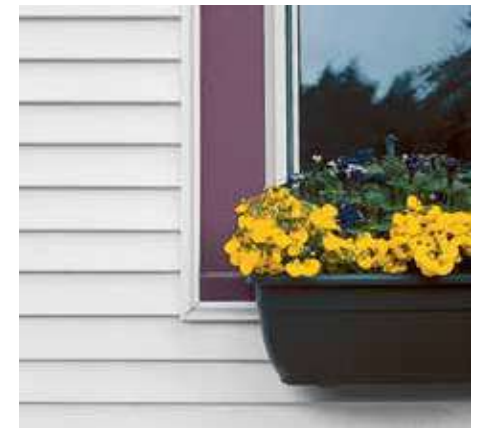
Trimworks custom crown molding used with wood window trim.