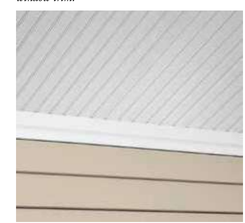
Greenbriar® Vintage Beaded soffit and Trimworks soffit crown molding.